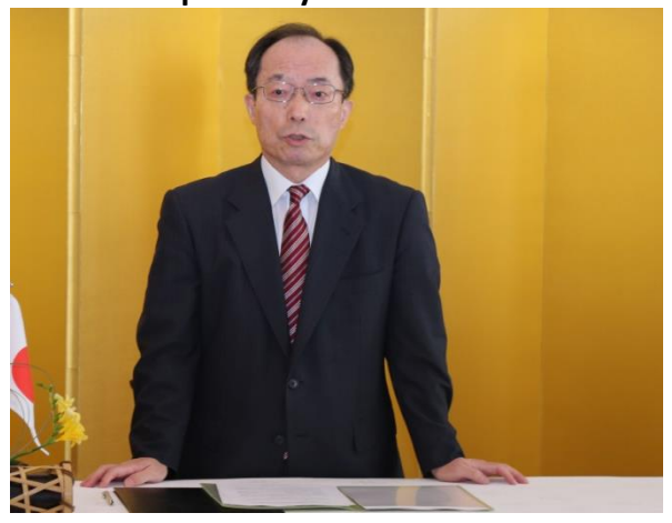
Speech by Ambassador